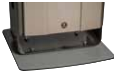
Free standing base kit (60 litre model only)