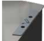
Ashtray volume: 1 litre