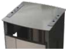
Hood mounted ashtrays