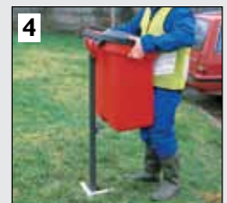
4 Locate and fix bin to post. Full fixing details are provided with each installation kit.