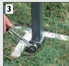
3 Using the one bolt fixing, insert and secure mounting post.