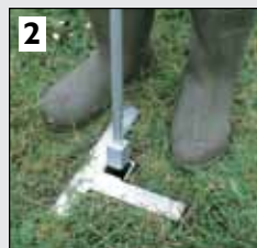
2 Barb is activated using special tool provided.