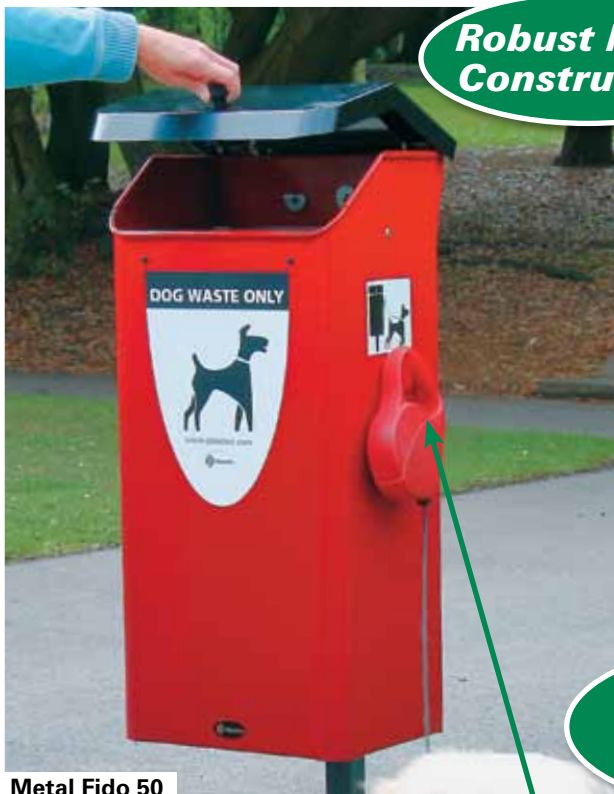
Metal Fido 50