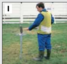
1 Socket is driven into ground using installation cap supplied and sledge hammer.

The Ground-Lock fixing system is quick and easy to install.