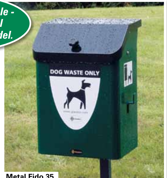
Metal Fido 35